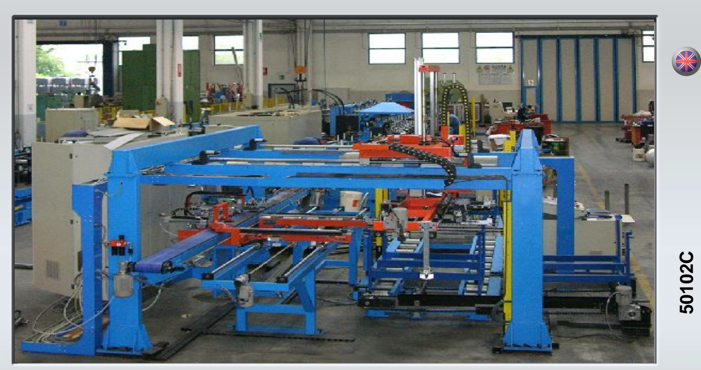
View of the line