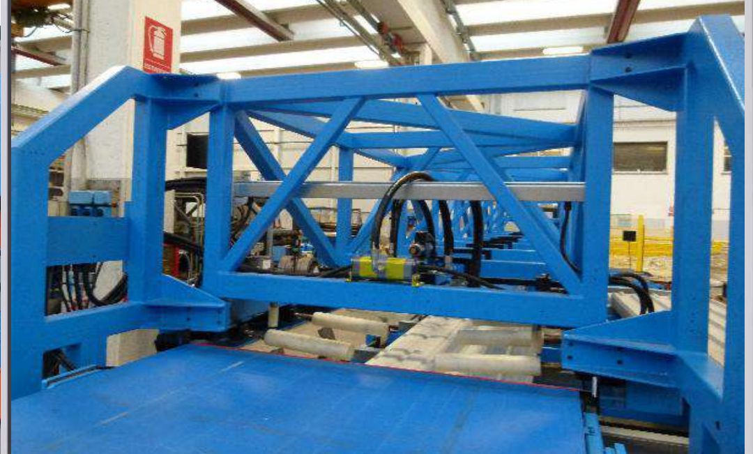
Material: Copper, Pre-painted, S.S. 0,5-1 Line direction Left-Right Line colour Blu 5015 RAL Useful width 1290