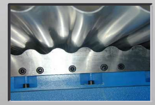
Corrugated sheet shearing