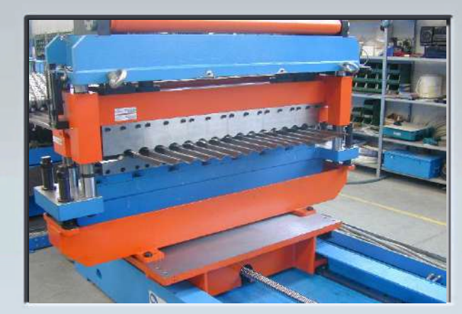
Flying cutting press for corrugated sheet

Production of corrugated and trapezoidal sheet with flying cutting unit