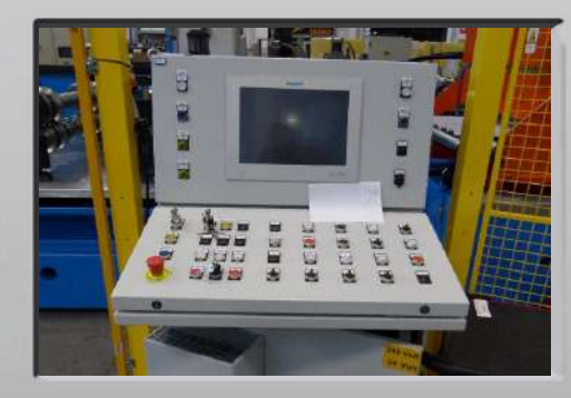
Control panel for trapezoidal sheet